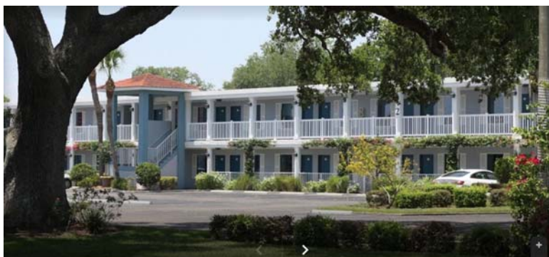
Southern Oak Inn 2800 N Ponce De Leon Blvd, St. Augustine, FL 32084 Phone: (904) 342-2354