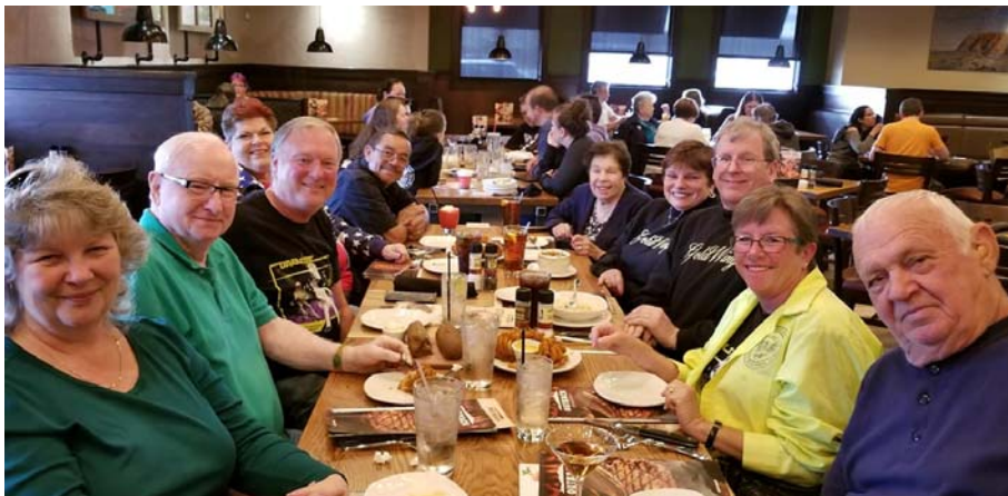
Pennsylvania District Rally